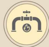
Gas Pipe Line