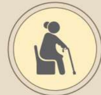
Senior Citizen Sit-out