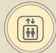
Lift Of Standard Make